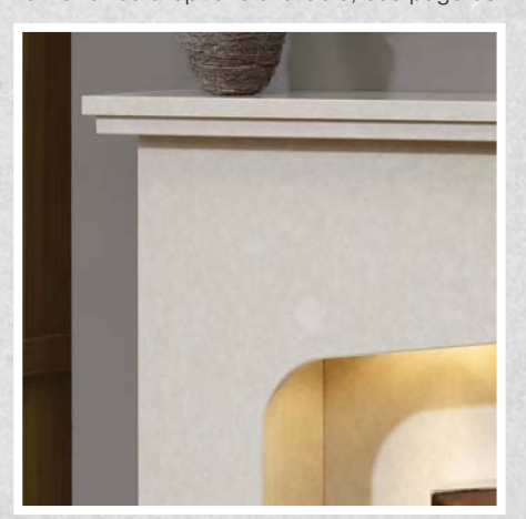
Other sizes & options available, see page 06

Surround shown as a 1220mm wide version in Fiorito Italica with Square Boxed & Lipped Hearth.