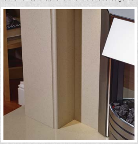
Other sizes & options available, see page 06

Surround shown as a 1380mm wide version in Beige Marfil with a Square Boxed & Lipped Hearth.