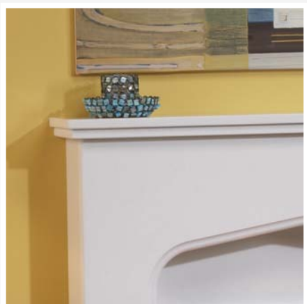
Other sizes & options available, see page 06

Surround shown as a 1070mm version in Polare with a Square Boxed & Lipped Hearth.