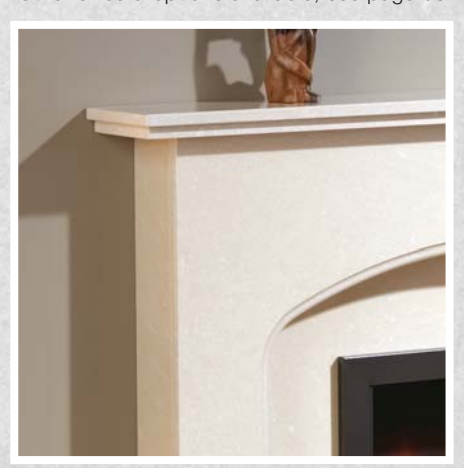
Other sizes & options available, see page 06

Surround shown as a 1380mm wide version in Venetian Cream with Square Boxed & Lipped Hearth.